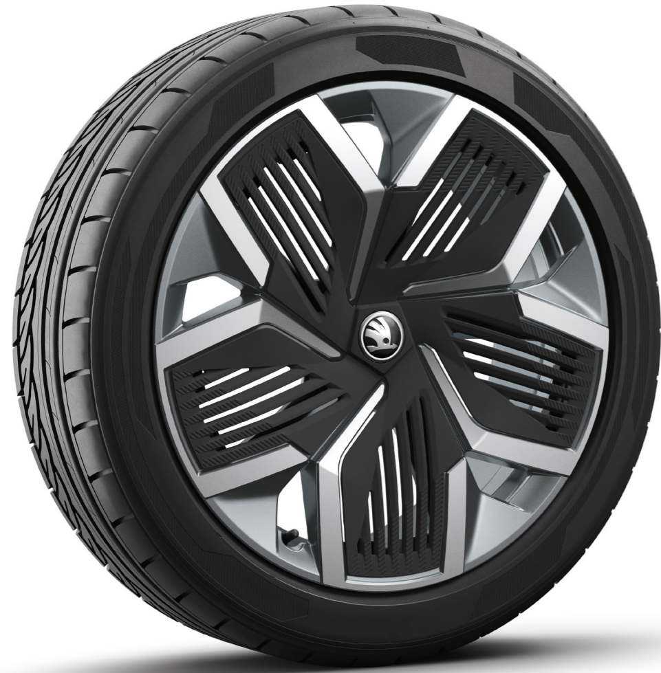
20" Rila Aero anthracite alloy wheels with black Aero covers