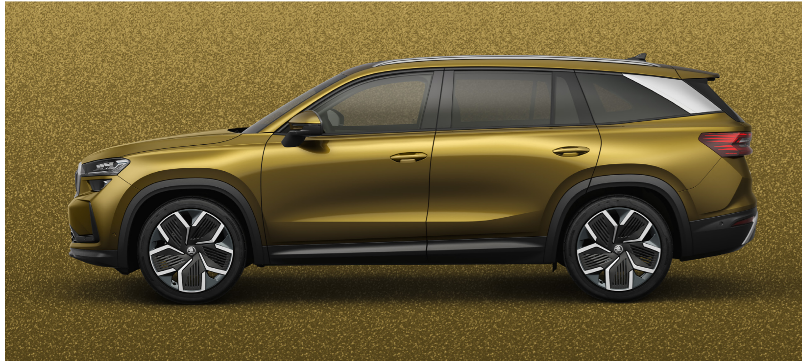
Bronx Gold metallic