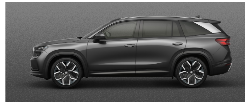
Graphite Grey metallic