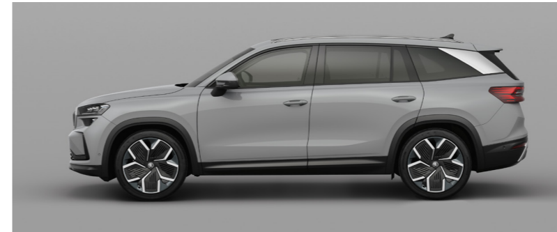
Steel Grey uni