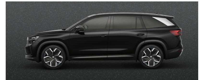
Magic Black metallic