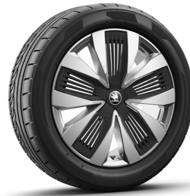
19" Talgar Aero silver alloy wheels with black Aero covers