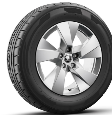
17" Paget Aero silver alloy wheels