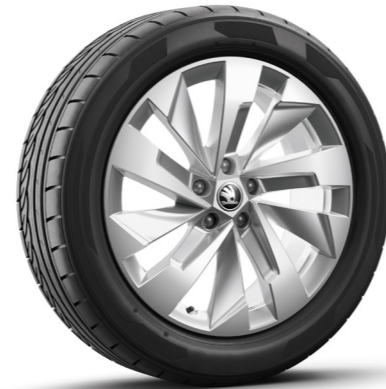
19" Rapeto silver Aero alloy wheels