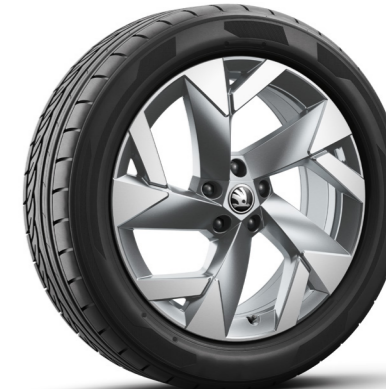
19" Tirsuli Aero anthracite alloy wheels*