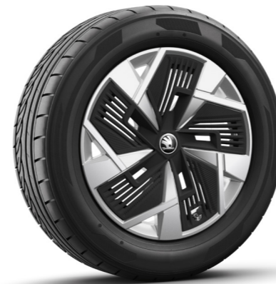
18" Mazeno Aero silver alloy wheels with black Aero covers