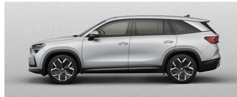
Brilliant Silver metallic