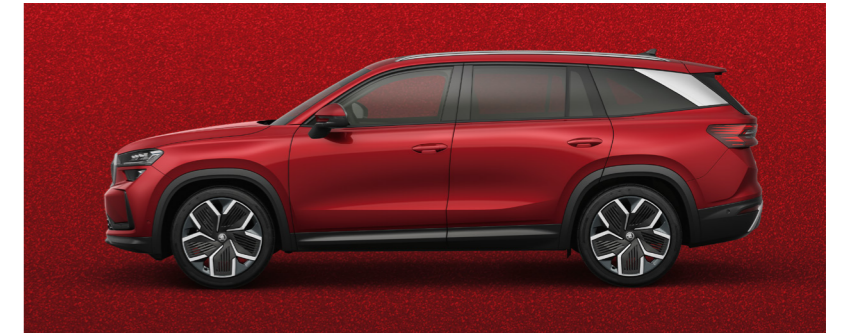
Velvet Red metallic