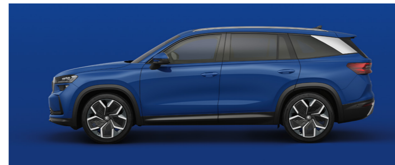
Energy Blue uni