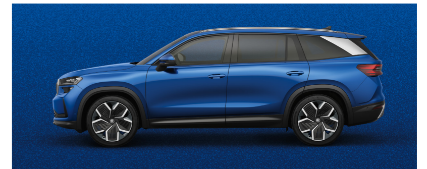
Race Blue metallic